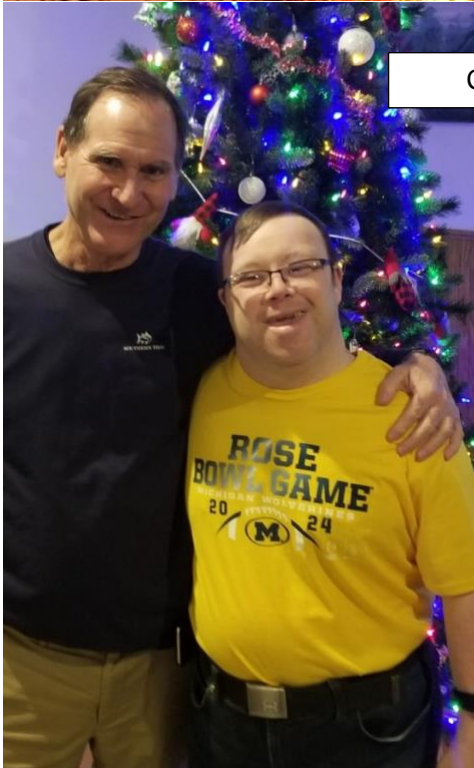
Christmas at MBC!