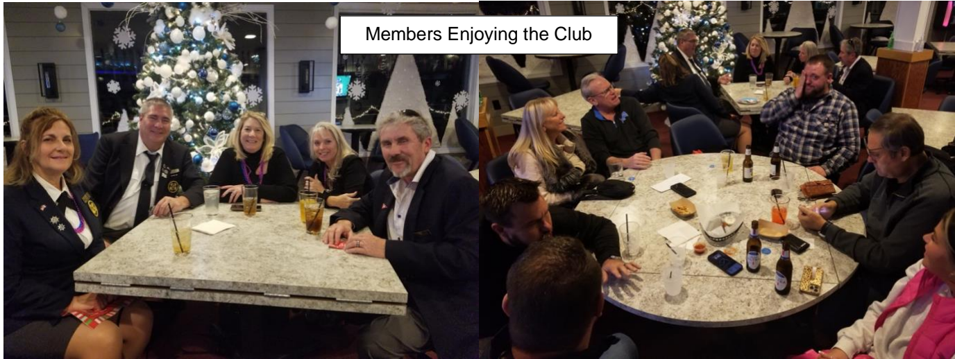
Members Enjoying the Club